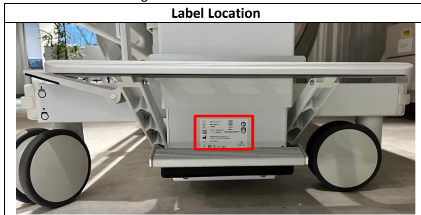
Figure 2. HA FlexTrak Label Location

The HA FlexTrak identification label is positioned on the handgrip side of the trolley below the pump pedal, as shown in Figure 2.