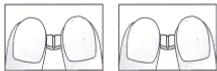
Diagrams 3 and 4: Easy breaking of half of the Nebivolol 5 mg cross-scored tablet into quarters.