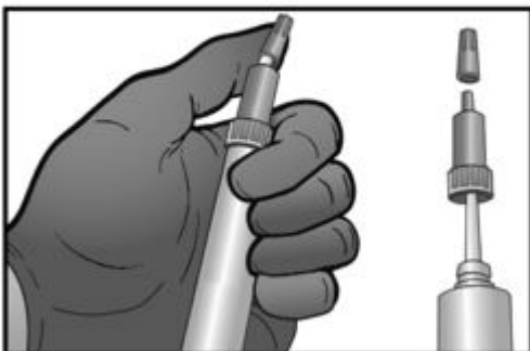
Step 1: Removal of the breakable cap