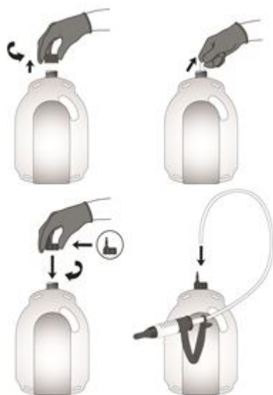
Figure 2 Attaching the recommended dosing gun to the 2.5 and 5 litre containers:

Vented caps should be placed for a later use in the cardboard box.