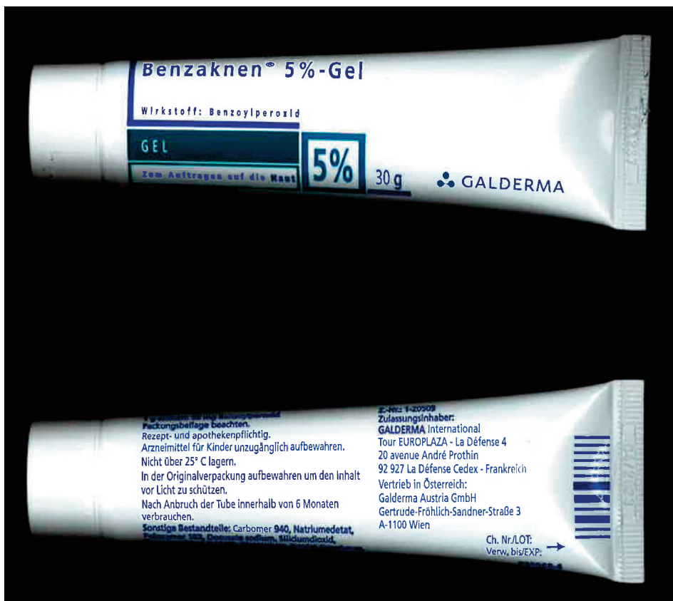
Scan of source country tube